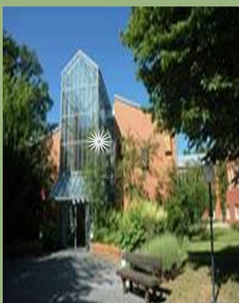
Wilhelm-Kempf-Haus, Tagungshaus in Wiesbaden Naurod

This is reminder for the 2 nd Int'l Conference, of The Catholic Eparchy of Keren, to be held in Frankfurt Germany.