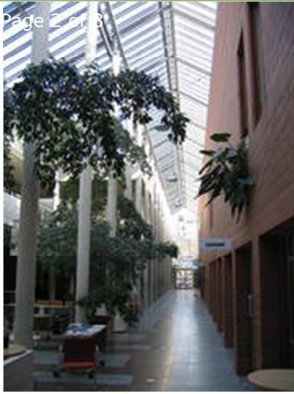
Wilhelm-Kempf-Haus, Tagungshaus in Wiesbaden Naurod